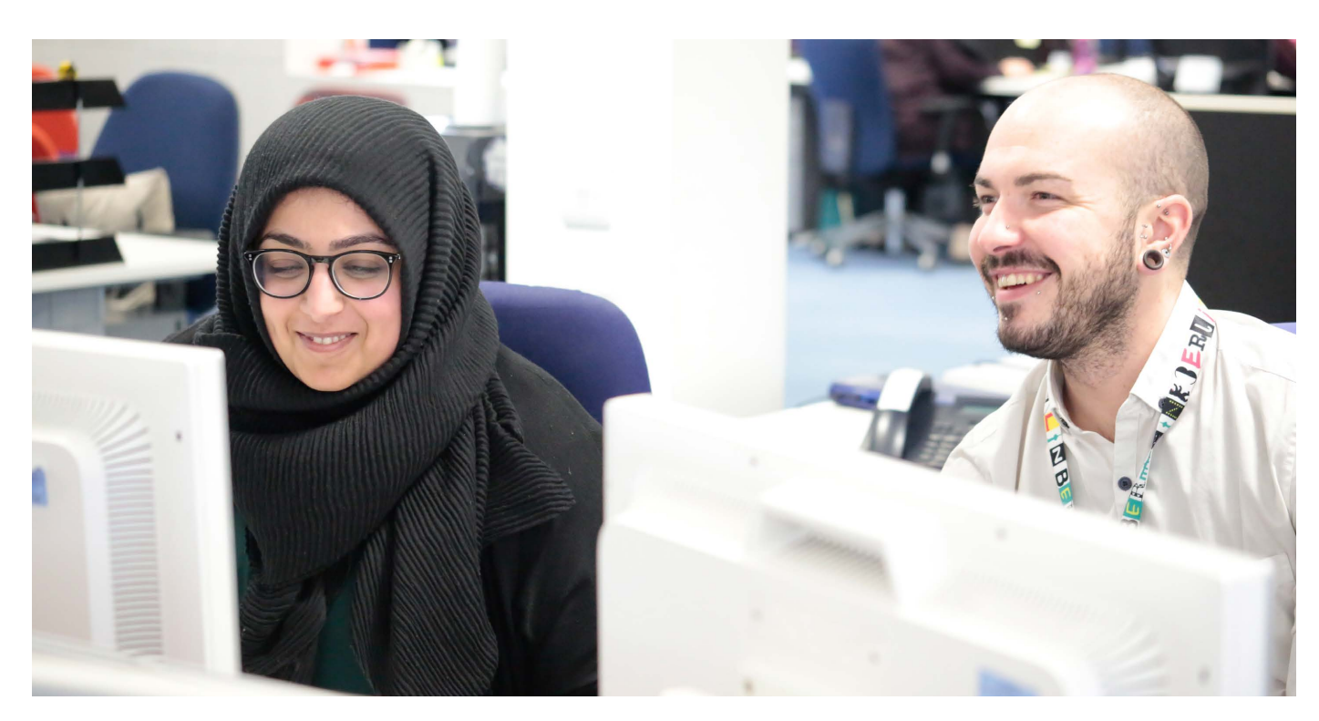
"Excellence is rewarded and talent thrives"

Beyond FMG, there must be a wider, collective effort to bring more women into the automotive industry. To achieve gender equality we must focus on maintaining a culture of inclusiveness, with fair treatment and reward for all.